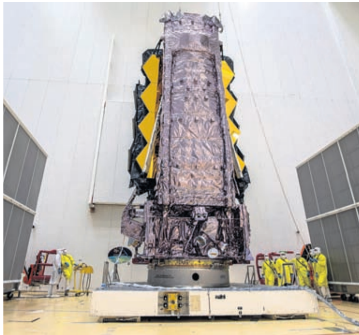
In this Saturday, Dec. 11, 2021 photo released by the European Space Agency, NASA's James Webb Space Telescope is secured on top of the Ariane 5 rocket that will launch it to space from Europe's Spaceport in French Guiana.

"Since it's Christmas Eve, all the congressional delegations that were going down, all of that has evaporated," he told The Associated Press. Even the NASA and contractor team has dwindled, he noted. But he'll be there. Already years late in fly-